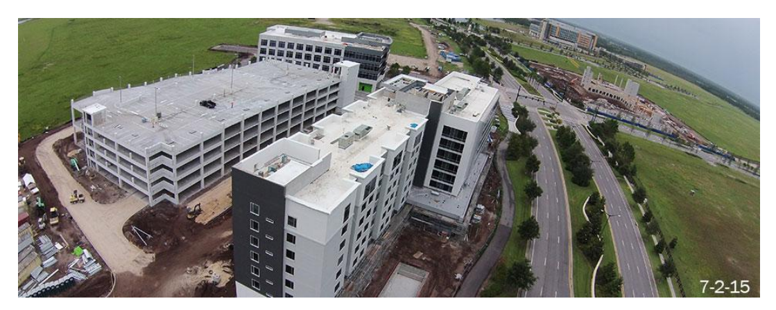
Aerial view of Lake Nona's dual-branded Residence Inn and Courtyard by Marriott

Lake Nona is located eight driving miles east of the Orlando International Airport and is home to the Lake Nona Medical City, which includes the University of Central Florida's College of Medicine, Sanford Burnham Prebys Medical Discovery Institute, Nemours Children's Hospital, and the $656 million VA Medical Center. The current stage of development includes more than $150 million worth of construction on the Lake Nona Town Center, a 452,120-square-foot project that includes 84,352-square-feet of office and retail space, a 600-space, 228,512square-foot attached parking garage, and the first two hotels that will offer support to the community. Marriott's Residence Inn and Courtyard by Marriott are the planned anchors of this development phase, offering seven stories, 139,256 square feet, and a combined 204 rooms. The Lake Nona Town Center is situated on 8.7 acres of the "Medical City" and is scheduled for completion this summer. Currently, the closest lodging options are located over six miles away, north of the Orlando International Airport.