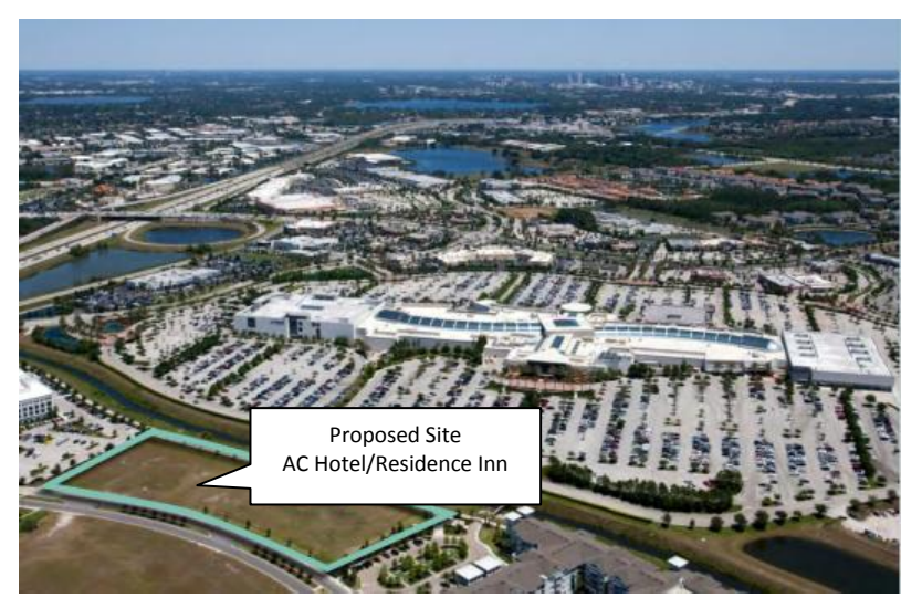
Aerial view of the Mall at Millenia

property on a 4-acre site just west of the shopping center. The property will be a 254-room Marriott AC Hotel and Residence Inn. Marriott's AC Hotel concept, developed in 1998 yet new to the Orlando area, is described as European boutique and tailor-made for the modern traveler. Meanwhile, the more recognized Residence Inn by Marriott will attract both business and leisure travelers staying for an extended period of time. The developer is advancing through the approval process and construction is tentatively set to begin in the first quarter of 2016.